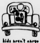
kids aren't cargo

Published opinions and advertisements do not necessarily reflect the views of the Spartan Daily, the School of Journalism and Mass Communications or SJSU.