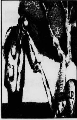
Volume 111, No. 22